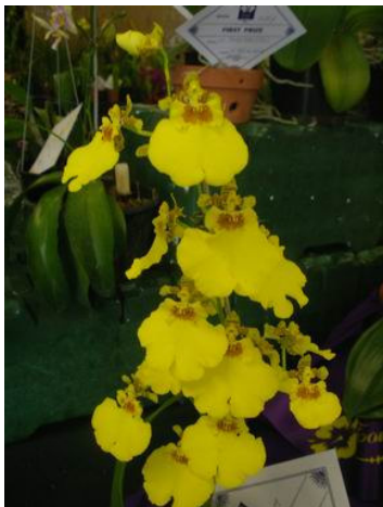
Onc. Sweet Sugar (Allan Hughes)