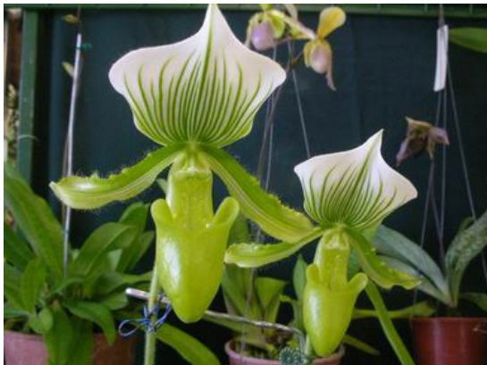
Paphiopedilum maudiae 'alba' owned by Allan Hughes.